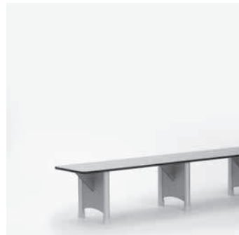
Single row bench