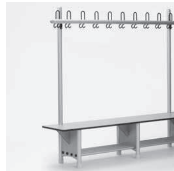
Single row bench with an upper coat rail and a shoe rack