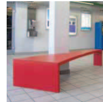
Special bench 3