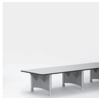
Double row bench