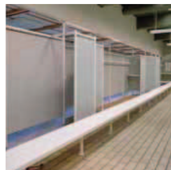
Bench for changing shoes