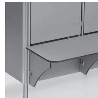
Bench seat HPL Compact