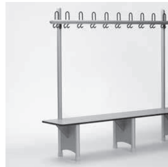
Single row bench with an upper coat rail