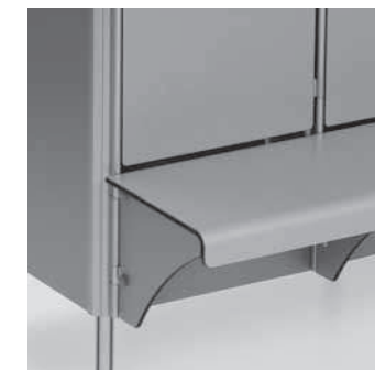
Bench seat HPL Compact forming