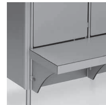
Bench seat HPL Compact mitre