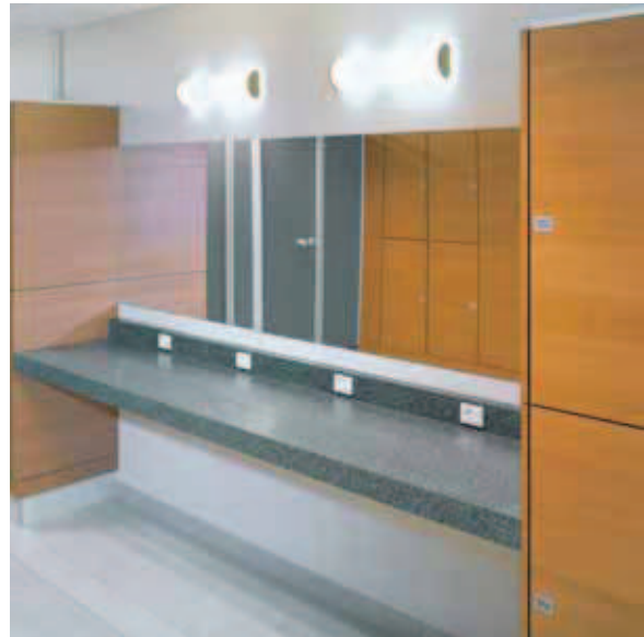
Vanity unit finished in solid surface material

Unit with several places including ample shelves out of solid surface material. In order to enhance comfort, additional wash basins can be integrated or placed on top.