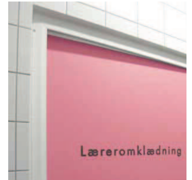
Door frames out of aluminium Optionally in white or coloured powder coating or in matt oxidised aluminium.