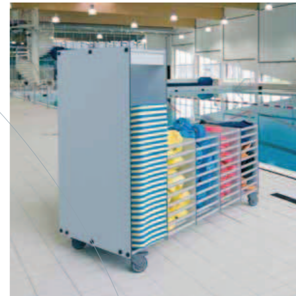
Set of shelves on wheels Set of shelves on wheels for storing swimming accessories directly in the pool area. Ideal for school classes and groups.