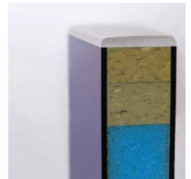
Water-resistant door leaves Non-rebated or as a deeper flat panel, can also be used for existing standard door frames. Rigid foam core with reinforced edges, covered with 3mm HPL Compact on both sides, surrounded by an impact-resistant PUR edge.