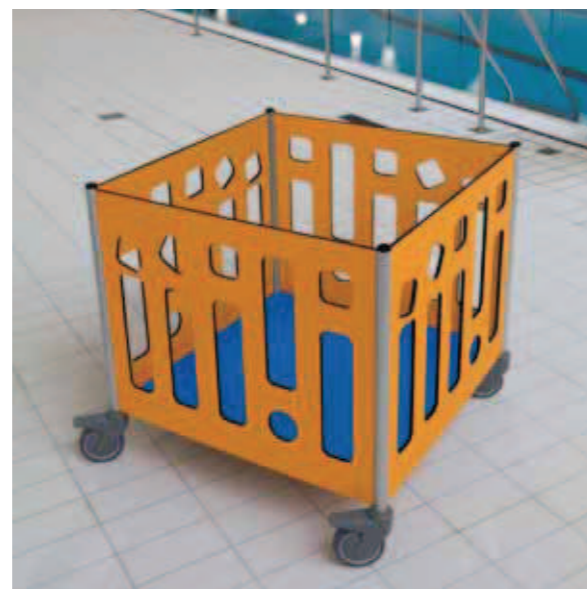
The playpen A model on wheels which is not bound to a location and can be quickly used on the spot.