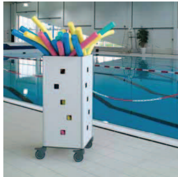
The "Noodles trolley" Storage box on wheels for floatation devices out of foamed material.

Well arranged storage elements which dry quickly Water-resistant construction elements