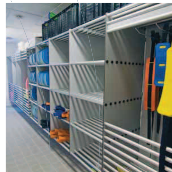
Storage shelves Stationary storage in the pool area or in separate storage rooms.