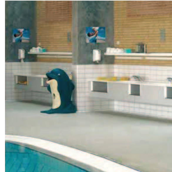
Svømmehal, Farum, Denmark Baby changing stations in the area of the children's pool.