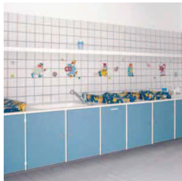
Roskildebadet, Roskilde, Denmark Lower cabinets out of the Geschwender locker system with a cover panel out of solid surface material.